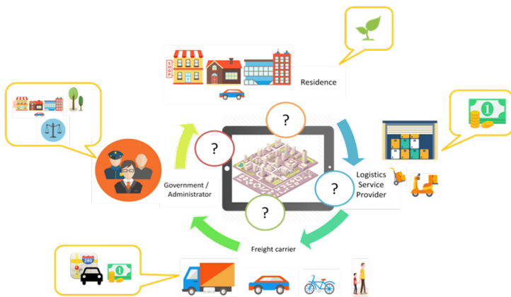
Involvement of Stakeholders through the Collaborative SGs (Icon Created by Macrovector – Freepik.com)

According to the mentioned potential of collaborative SGs, they can be used for engaging players to come together to solve problems or create new ideas while playing a game. Therefore, it can also be applied to improve the awareness of collaboration among stakeholders in urban logistics activities. The stakeholders in an urban area can play different roles in the game in order to learn to make decisions under the conditions of their roles as well as to understand the requirements of the others. The activities corresponding to the interaction between the stakeholders can be used as various scenarios in the game.